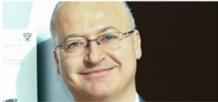
UAE Agora Group pave the way for Blockchain startups to meet with MENA investors